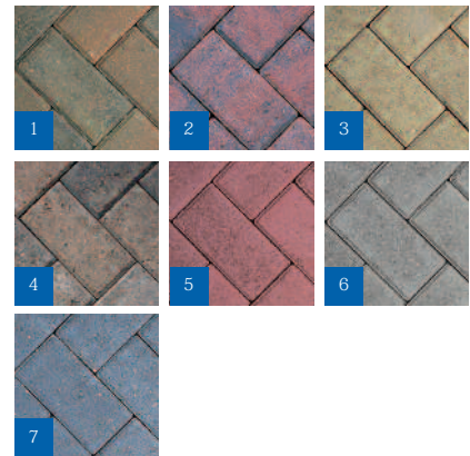
1. Autumn 2. Brindle 3. Buff 4. Burnt Oker 5. Red 6. Grey 7. Charcoal