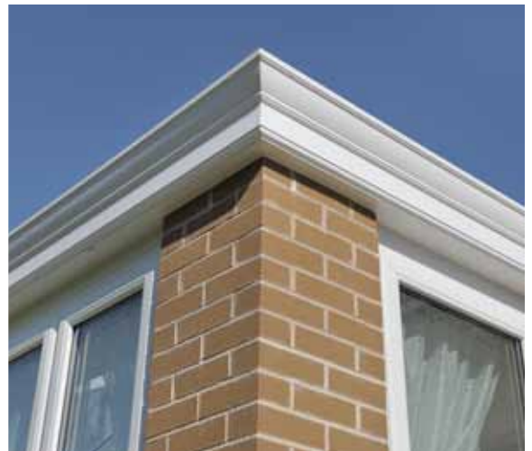
Add Cornice for a smooth finish at wall/roof interface